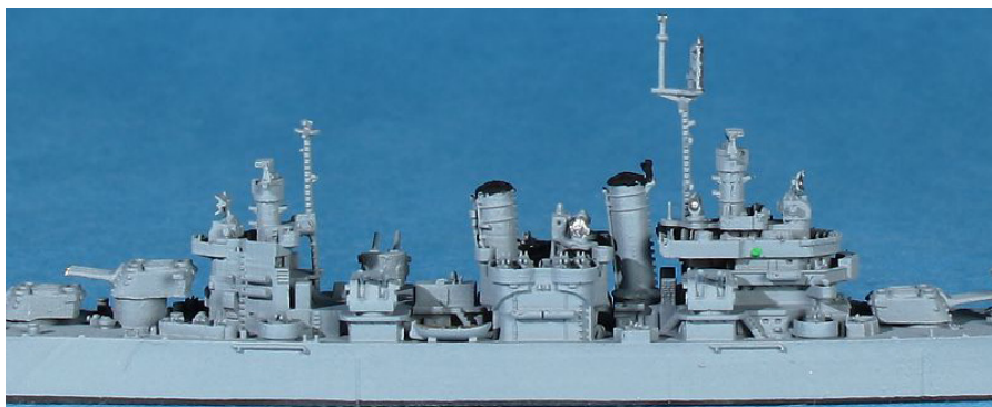
Neptun's recently released 1342C SAVANNAH (CL-42), U.S. CL, close-up of starboard side