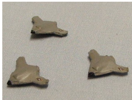
Left: Mountford's new 1:1250 99/104 F35C, U.S. Strike fighter, scheduled to replace the F18 Hornet; Right: Mountford's new 1:1250 99/105 U.S. X47B unmanned Stealth Fighter, scheduled for future CV deployment