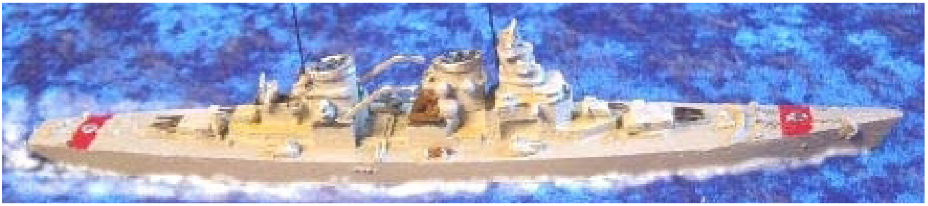
Superior 1:1200 G207 KREUZER P, German "Never-was" CB WWII design; Photo & paint job by Bob Weymouth