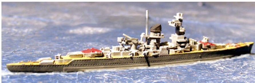
GHQ's new 1:2400 GEN20 ADMIRAL SCHEER. German WWII AS