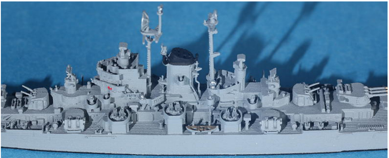
Neptun's new 1340D FARGO, midships detail