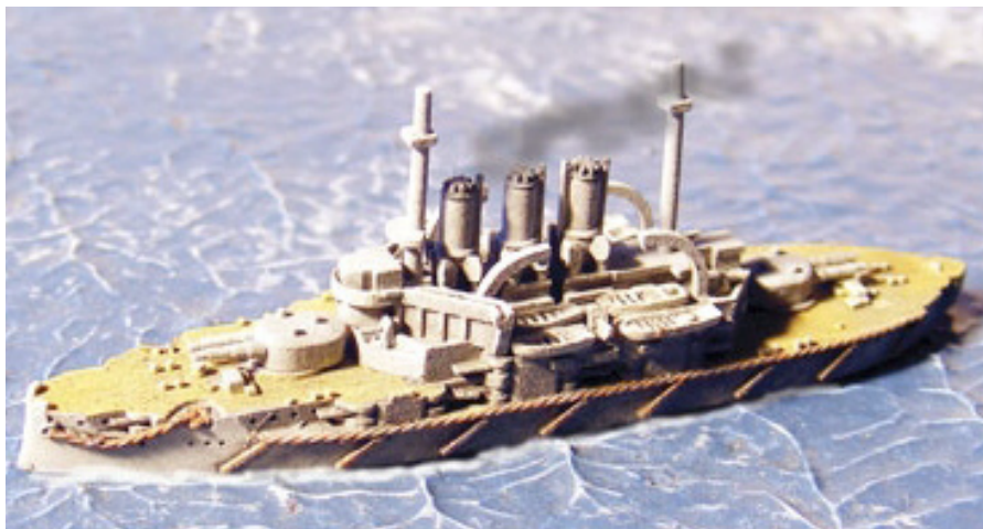
GHQ'S new 1:2400 GWR10 PANTELIMON (ex-POTEMKIN), Russian WWI BB