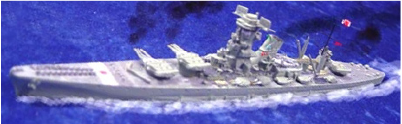
Superior 1:1200 J202 B-65 (Project 65), Japanese "Never-was" CB, design of the 1930's; Photo & paint job by Bob Weymouth