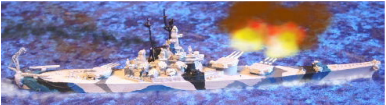
Superior 1:1200 A133 B-65(I), "Never-was" U.S. BB, IOWA variant; Photo & paint job by Bob Weymouth